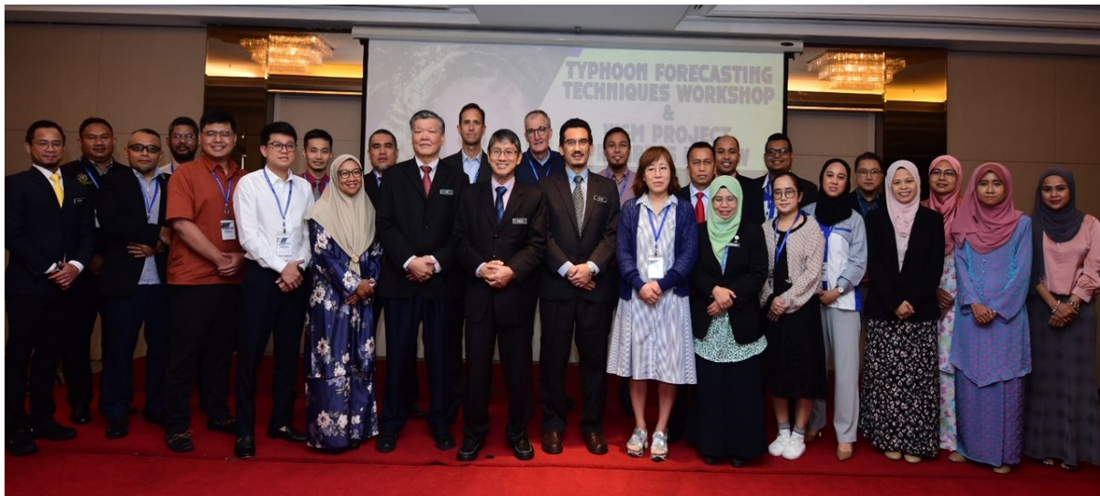
Figure 2: Opening ceremony of the Typhoon Forecasting Techniques Workshop

Meteorological Department (MET Malaysia) in collaboration with TRCG and the Working Group of Meteorology (WGM). The Workshop aimed to train younger operational forecasters of TC Members on tropical cyclone forecasting knowledge and techniques. Training was delivered in hybrid format that included various topics such as the Fundamental of Tropical Cyclone, interpretation of satellite data in operational tropical cyclone forecasting, analysis of satellite data in Tropical Cyclone, impact-based forecast and warning services approach, and tropical cyclone rainfall prediction and application of NWP products. The opening ceremony was inaugurated by the Director General of MET Malaysia, Mr Muhammad Helmi Abdullah (Figure 2). The lectures were delivered by 5 experts including two from the United States of America and the Vice-Chair of TRCG that they joined in person. There were 2 online speakers with one from the Korea Meteorological Administration and another from the Shanghai Typhoon Institute. The total number of participants were 24 that consisted of 19 physical attendees and 5 online. Both Chairmans of WGM and TRCG also delivered speeches during the opening ceremony.