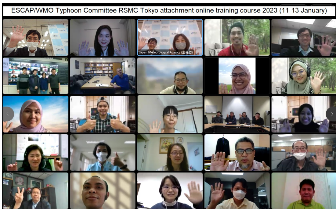
Figure 4: RSMC Tokyo Attachment Training course

3.9 The RSMC Tokyo continued to organize the Attachment Training course remotely on 11 – 13 January 2023. A total of 51 forecasters participated in the Attachment. Invited lecture was delivered by Associate Prof. Ito of the University of the Ryukyus on recent progress in the understanding of tropical cyclone motion. Topics on new services and products of the RSMC Tokyo, Dvorak analysis, numerical weather forecasting of tropical cyclones and effective hazard information design and public awareness were presented.