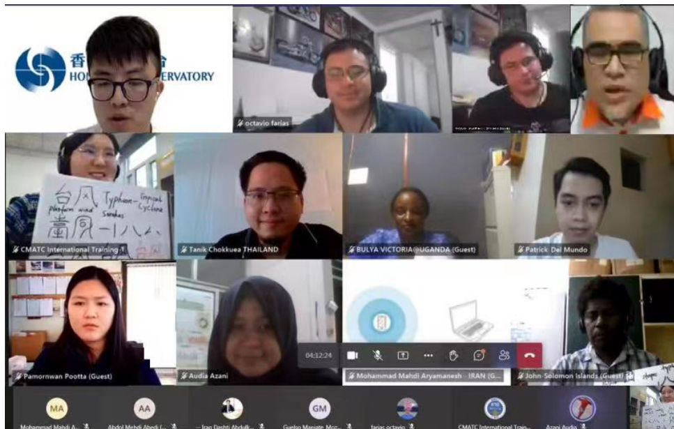
Figure 3: CMA Typhoon Forecaster Training 2022

hosted a training course titled “International Training Course on Tropical Cyclone Forecast” during 27 June to 8 July 2022.